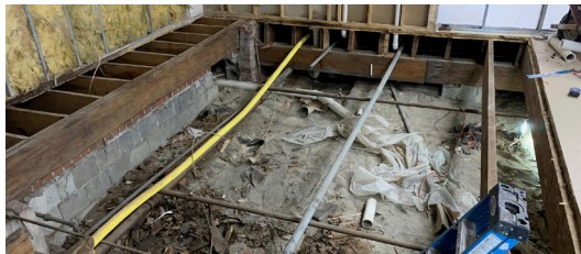
Underside of the old removed freezer