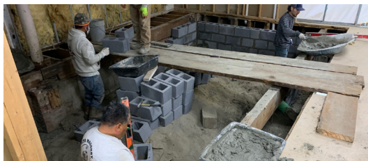
Getting floor ready for freezer cooler