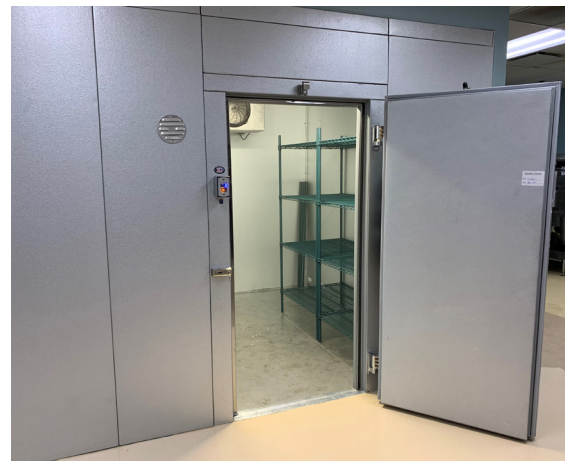
Finished cooler with new antimicrobial racks