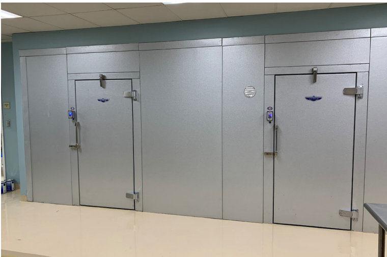
Finished freezer and cooler units