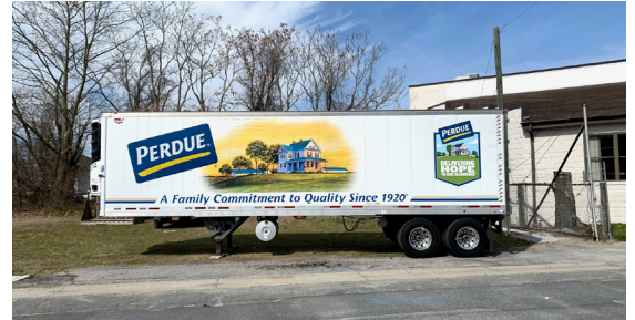
Perdue freezer trailer