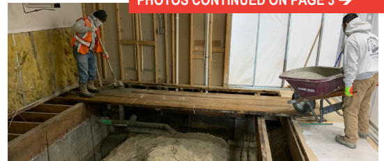
Preparing space for new concrete pad