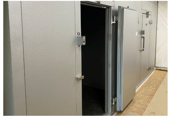
Newly Installed freezer cooler units