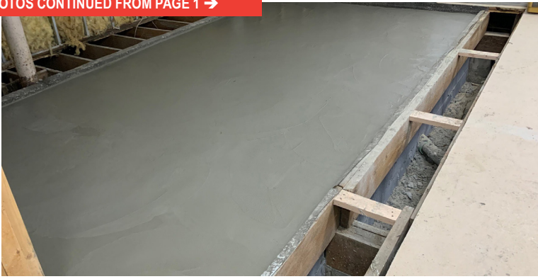
Concrete slab completed