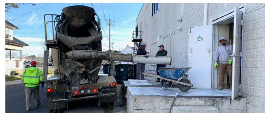
Pouring concrete for freezer cooler